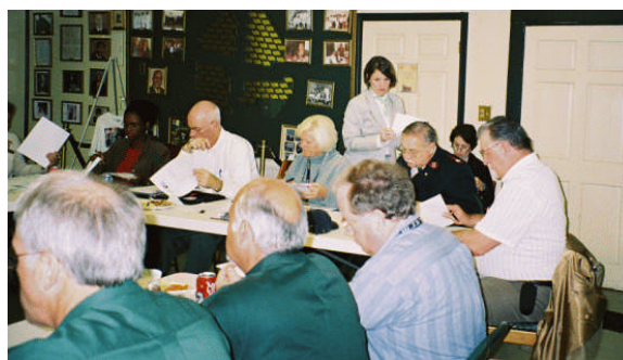
Long Term Recovery Coalition meeting

One of the primary functions of such a coalition is to collectively address cases of Unmet Needs, where the needs of a client family are greater than a specific agency is able to meet by itself. Moving to where we were able to function as an Unmet Needs Committee was a slow process: families were developing their personal recovery plans in a confusing and constantly changing environment, and service agencies took time to assemble their programs, to marshal resources, and to connect with clients.