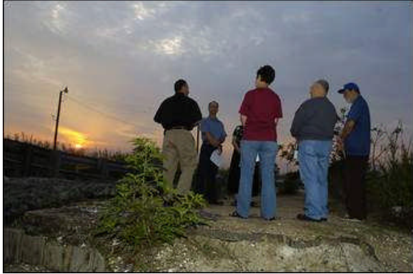
Sunrise prayer service on the Vermilion Parish Gulf Coast on June 1 st Day of Prayer.

Jesus promises us that, if we “abide in him, and let him abide in us,” we can “ask what we will, and it will be granted.” It is important, as we pray, that we “believe that we have received” what we are asking for. Knowing that our faith is strengthened by our holding visions and feelings of our prayer answered in our imagination, we encouraged people to see calm seas in the Atlantic and prayers forming a Bridge of Peace from the Gulf Coast to the West Coast of Africa.